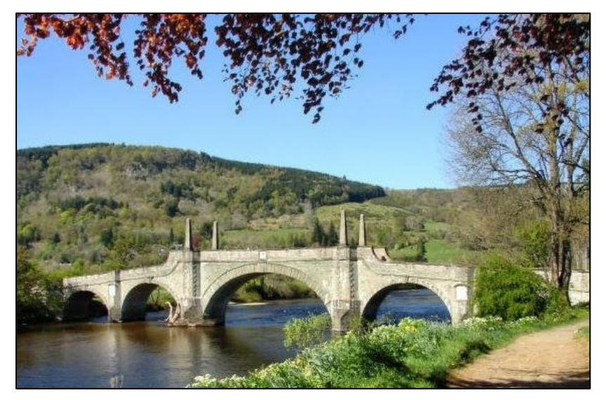
Figure 9: Wades Bridge – Aberfeldy.

This mention of Scythia is very interesting, because the original Celts came from Scythia on the shores of the Black Sea many centuries previously, before some of them settled in Scotland as the Picts.