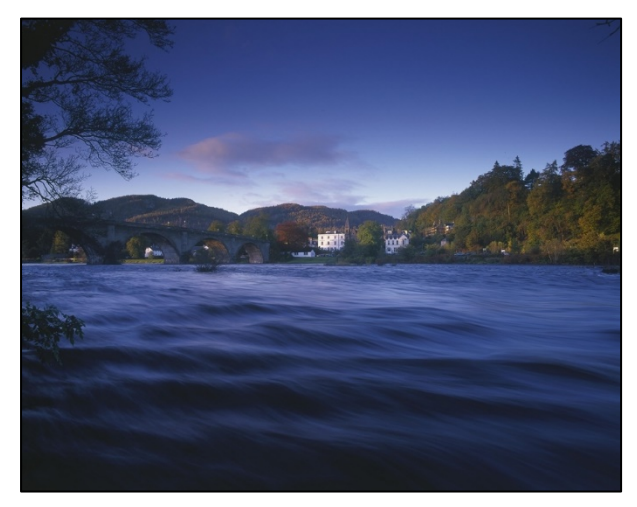
Figure 1: Dunkeld – Gateway to the Highlands.

army, decided to ensure that the long series of Jacobite uprisings – with previous flare-ups in 1689,1708,1715 and 1719 – were brought to an end once and for all. So, he sent out columns of troops throughout the Highlands to burn every farmstead, croft and house, to murder their inhabitants and to round up all their cattle (20,000 head) and send them South, thus wiping out the entire economy of the Highlands. At one stage, he considered sending the whole population of the Highlands over to the colonies. For all these genocidal horrors, he became known as "Butcher" Cumberland.